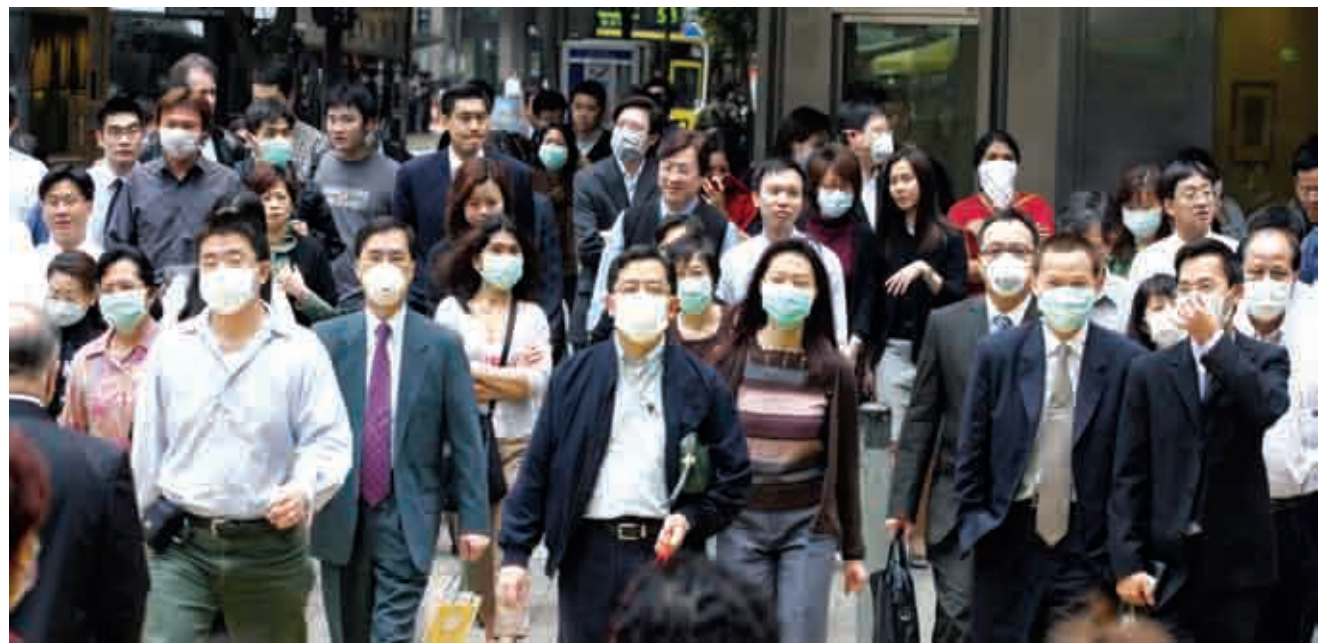
Hong Kong people stoically soldiered on during the epidemic. \odot