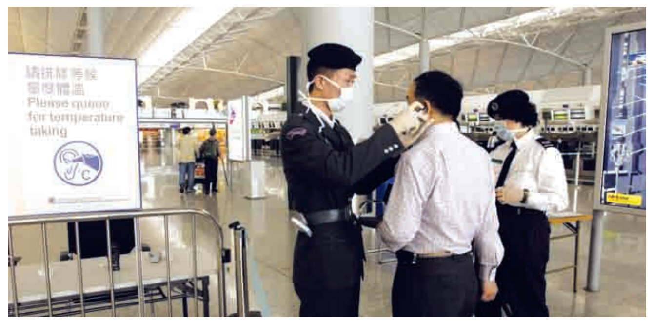
The temperature of a passenger is checked at the airport.

In the aftermath of these crises, Hong Kong went through several years