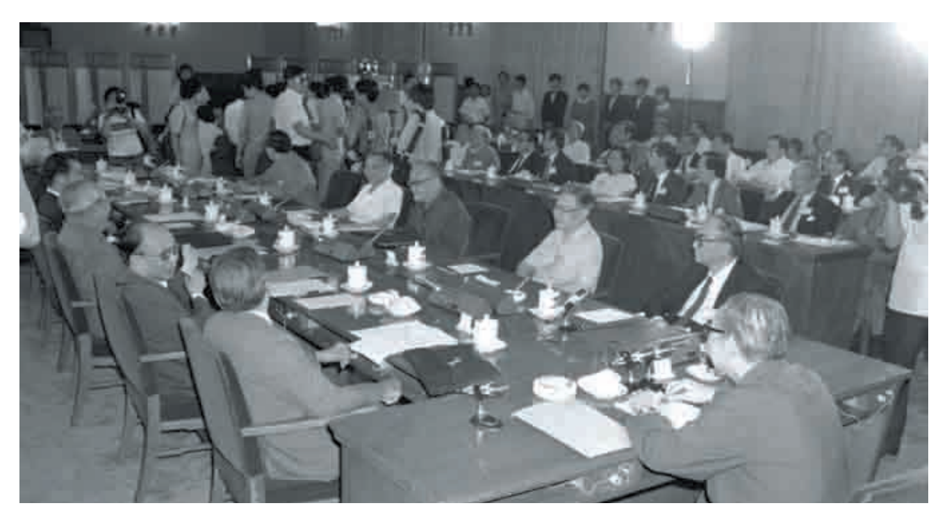
On 1 July 1985, the Drafting Committee for the HKSAR Basic Law held its first plenary meeting in Beijing. Chairman Ji Pengfei presided at the meeting.

After the Sino-British Joint Declaration was signed, the Third Session of the Sixth NPC decided to form the Drafting Committee for the Basic Law of the HKSAR of the PRC. This Committee was composed of people from all walks of life and experts from the Mainland and Hong Kong. Its task was to prescribe the system to be practised in the HKSAR in the form of law (i.e., the Basic Law), based on the 12 Principles stipulated in the Joint Declaration.