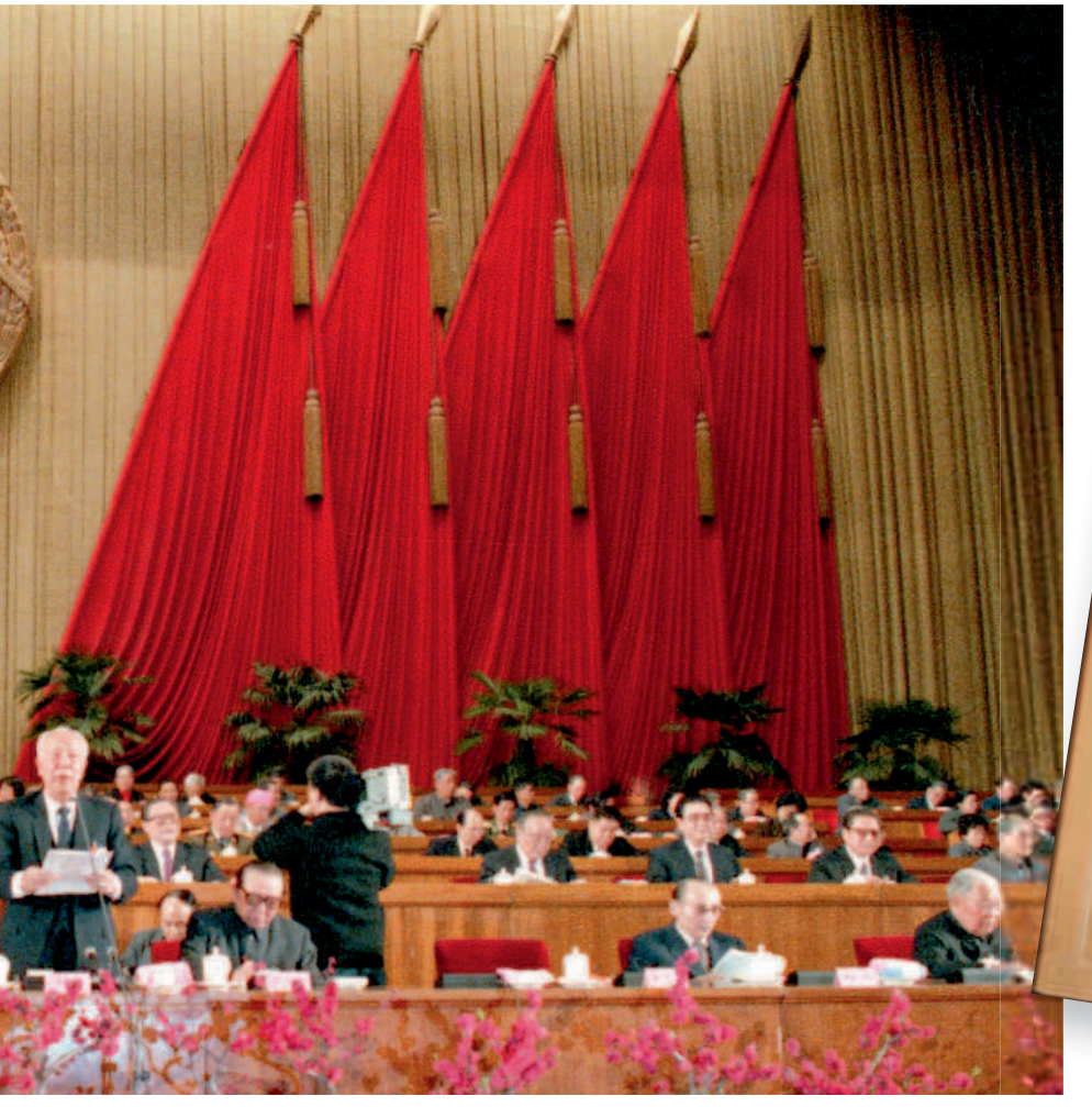
The Basic Law of the Hong Kong Special Administrative Region of the People's Republic of China was adopted at the Third Session of the Seventh National People's Congress on 4 April 1990.

According to the basic principles stipulated in the Sino-British Joint Declaration and in light of the actual situation in Hong Kong, the Basic Law was enacted in accordance with Article 31 of the Constitution, prescribing the establishment of the HKSAR directly under the CPG and the basic contents of the "One Country, Two Systems" principle to be practised in the