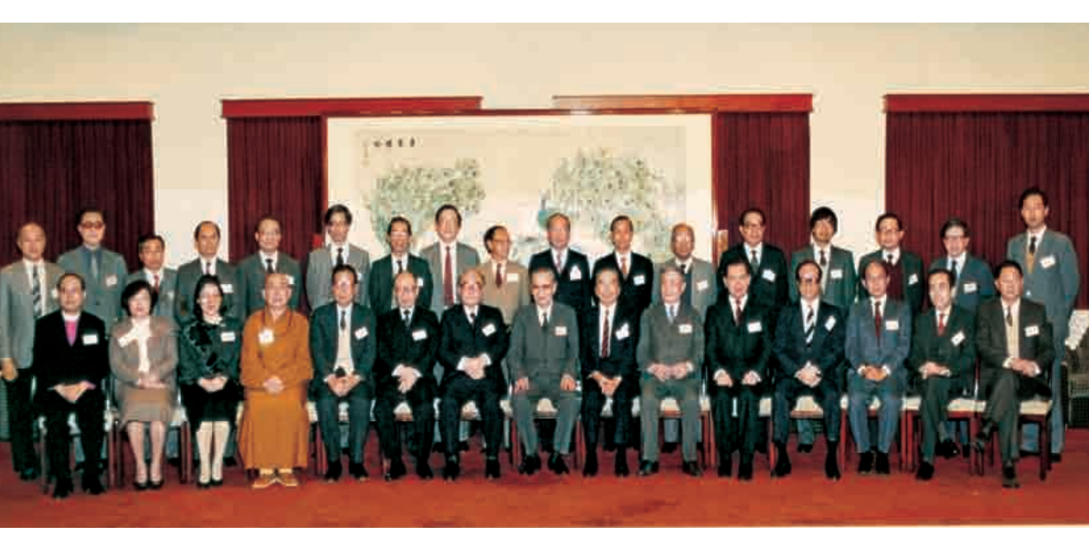
representative advisory organisation in the history of Hong Kong".

The Consultative Committee formed eight sub-groups, collecting views and comments on issues relating to the Basic Law, namely, (1) the structure of the Basic Law; (2) the political structure; (3) law; (4) residents' rights and duties; (5) finance, business, and economy; (6) culture, science and technology, education and religion; (7) external affairs; and (8) the relationship between the Central Authorities and the Special Administrative Region (SAR). The Consultative Committee held two rounds of consultation on drafting the Basic Law. The first was from May to September in 1986, the second from February to October in 1989.