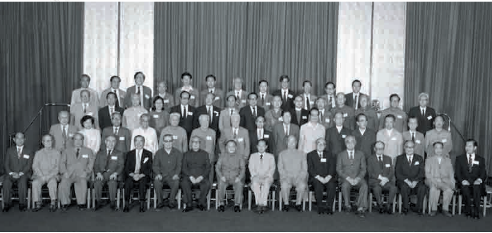
National leaders Deng Xiaoping, Li Xiannian, Peng Zhen and Hu Yaobang and Members of the Drafting Committee.