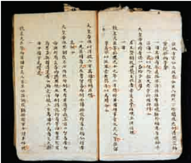
The transcript of the Treaty of Nanjing, now in the First Historical Archives of China, included a provision on ceding Hong Kong to Britain.