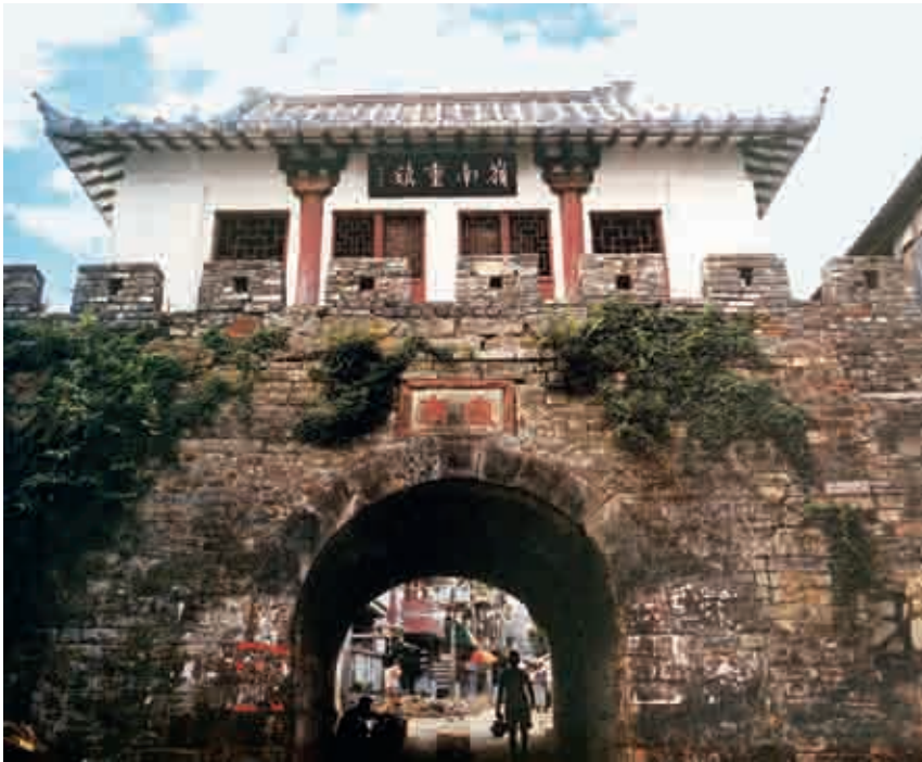
A famous monument connected to Hong Kong, the Gate Tower of Xin'an County, was built in the Hongwu period of the Ming Dynasty (1368-1389).

Neolithic Period, dating back 6,000 years. When China was unified during the Qin Dynasty, Hong Kong came under various local administrative units in the dynasties that followed. In chronological order, Hong Kong had come under Panyu County of Nanhai Prefecture, Bao'an County of Dongguan Prefecture, Bao'an County of