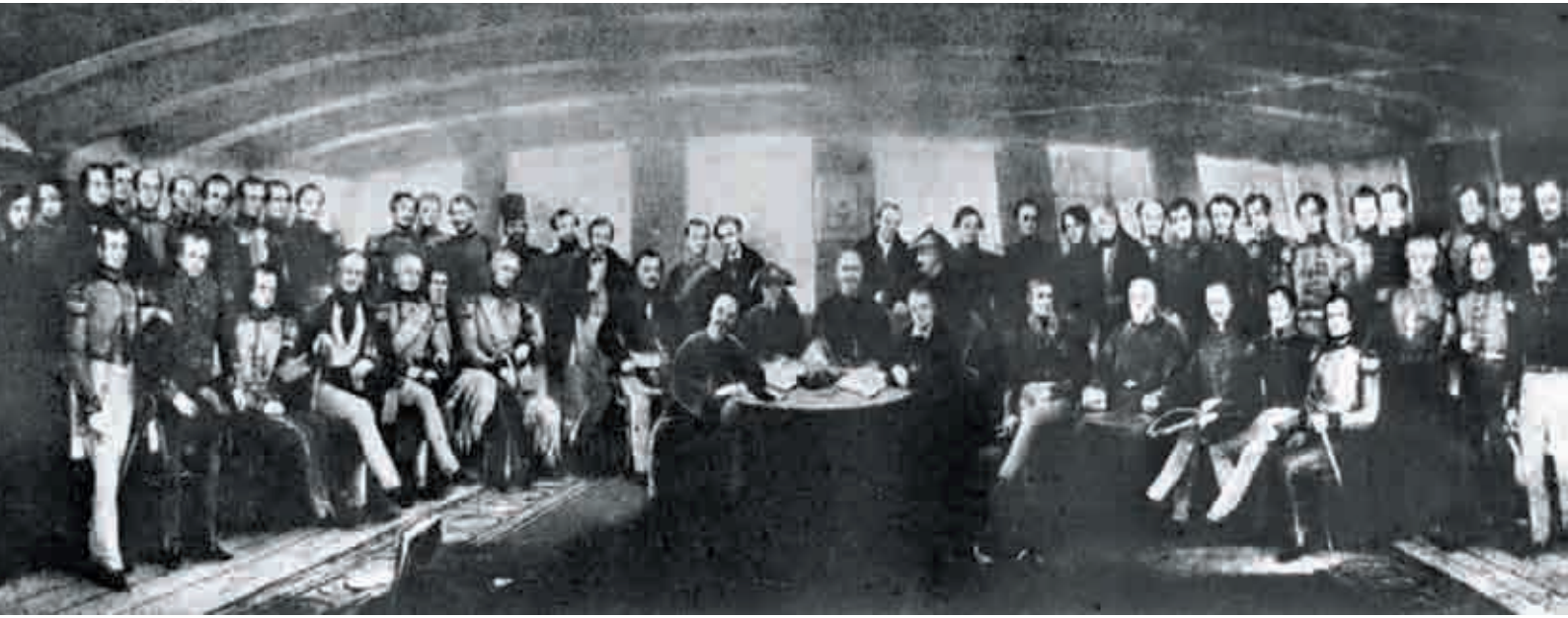
In 1840, Britain launched a war against China. Qing troops kept losing ground and were finally defeated in August 1842. The Qing Government and Britain signed the first unequal treaty in the modern history of China—the Treaty of Nanjing.

Guangzhou Prefecture, Dongguan County of Guangzhou Prefecture, and finally Xin'an County of Guangzhou Prefecture in the Qing Dynasty.