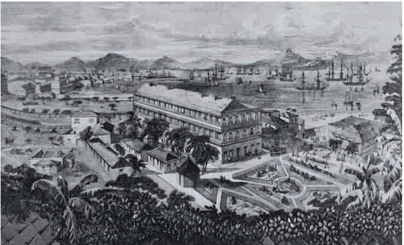
Hong Kong City and Harbour in 1850.

Hong Kong has been Chinese territory since ancient times. Based on archaeological findings, ancient Chinese began to settle in Hong Kong from the