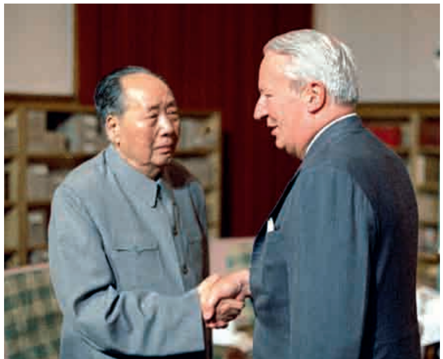
Picture shows President Mao Zedong meeting British Prime Minister and Leader of the Conservative Party Edward Heath.

At the Third Plenary Session of the Eleventh Central Committee of the CPC held in Beijing on 18 December 1978, three important missions were proposed: establishing world peace, accomplishing national reunification and speeding up modernisation in four areas: industry, agriculture, defence, and science and technology. The resolution of the questions of Taiwan, Hong Kong and Macao was put on the agenda at this time.