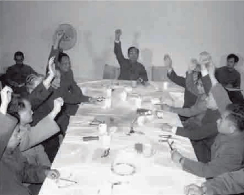
In September 1981, the standing committee members of the Taiwan Democratic Self-Government League held a meeting to uphold the Nine Principles proposed by Ye Jianying to achieve Chinese peaceful reunification.

On New Year's Day of 1979, the Standing Committee of the National People's Congress (SCNPC) published A Message to Compatriots in Taiwan which, for the first time, declared to the international community the major policy of the PRC to strive for peaceful national reunification. Soon after, during his visit to the United States, Deng Xiaoping publicly declared that "we will respect the realities and current systems there so long as Taiwan returns to the Motherland." This was the first time a national leader had articulated the idea of "One Country, Two Systems" which could be followed within the sphere of one nation.