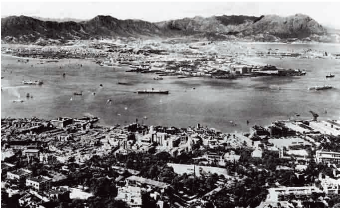
Old Hong Kong and Harbour.

Neolithic Period, dating back 6,000 years. When China was unified during the Qin Dynasty, Hong Kong came under various local administrative units in the dynasties that followed. In chronological order, Hong Kong had come under Panyu County of Nanhai Prefecture, Bao'an County of Dongguan Prefecture, Bao'an County of