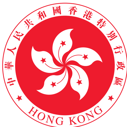
The Design of the Regional Emblem of the Hong Kong Special Administrative Region